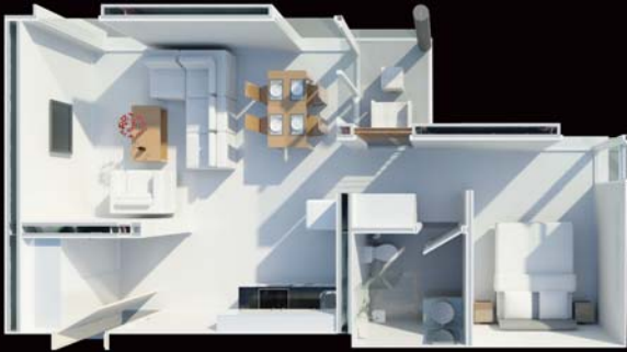
Plan Unit C