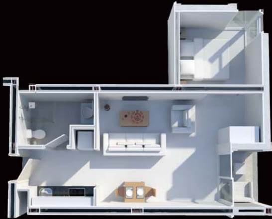
Plan Unit A