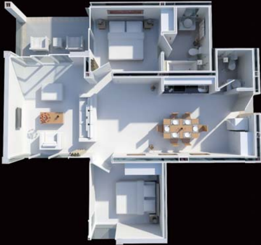
Plan Unit E