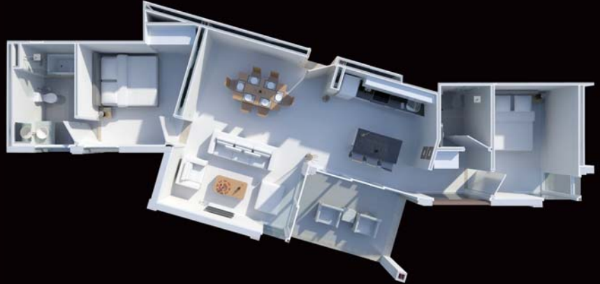
Plan Unit F