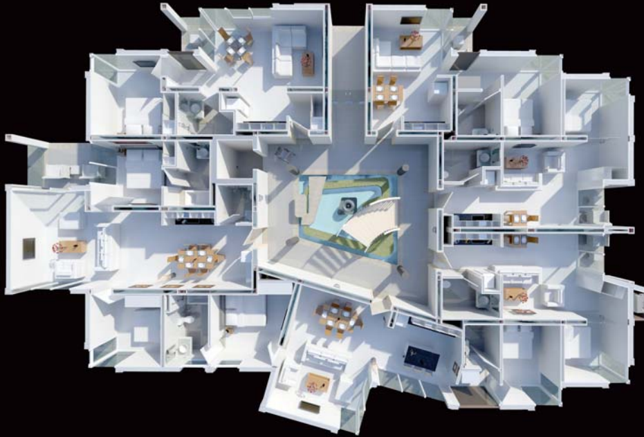
Condo Floor Plans