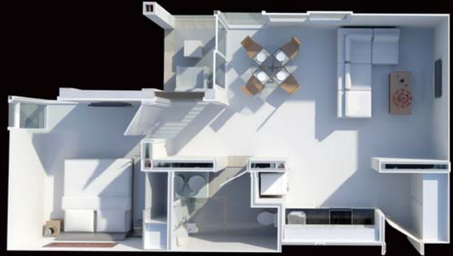
Plan Unit D