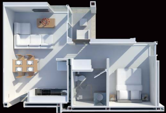
Plan Unit B